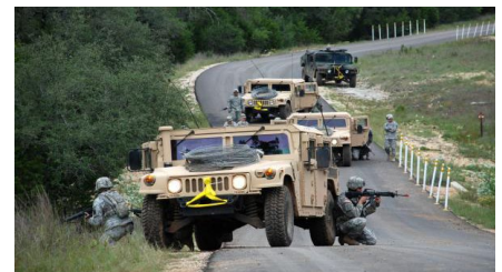
Preserving habitat for the golden-cheeked warbler (top) allows ground training sites at Camp to continue operation (bottom).